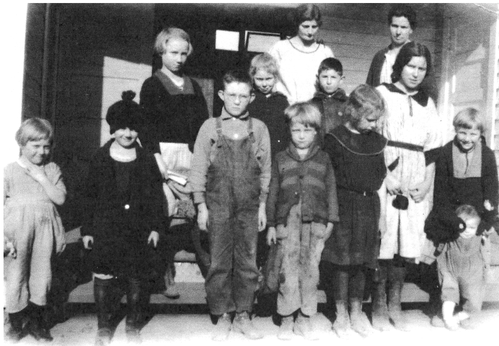
soap Creek grade School